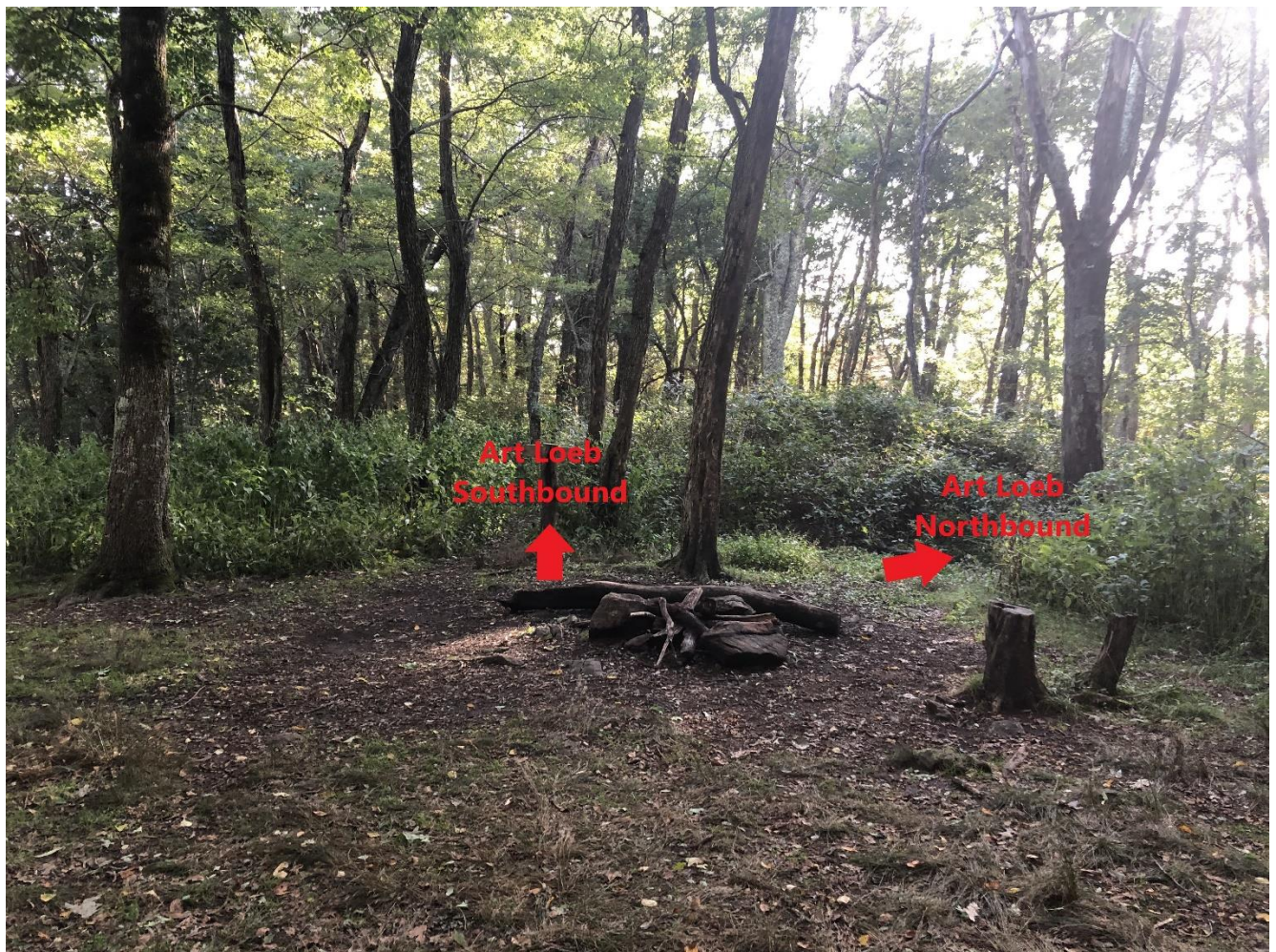
Figure 6: Deep Gap

Just below Deep Gap, but off the Art Loeb Trail is a second camping area. If you miss the immediate left turn when going Northbound it is easy to mistake this camping area as part of the trail and get confused as to where to go next. If you do reach this area, the trail is off the left. See Figure 7: Deep Gap camp site.