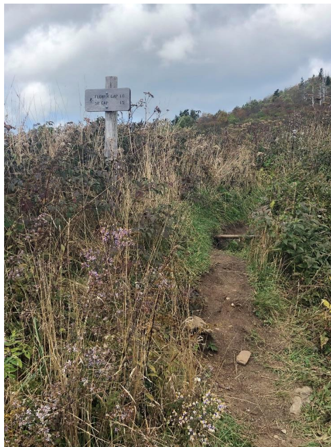
Figure 3: Turn toward Flower Gap

All numbers (distances, elevations) are estimates. This document is provided with best available information, no guarantees are expressed or implied as to accuracy, reliability or completeness. Use the information at your own risk.