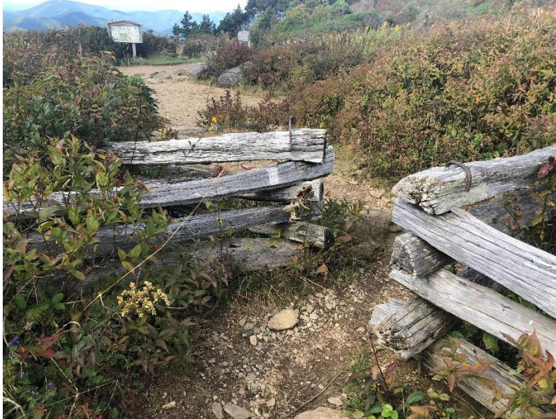
Figure 2: Wood barrier at Art Loeb/Ivestor Gap