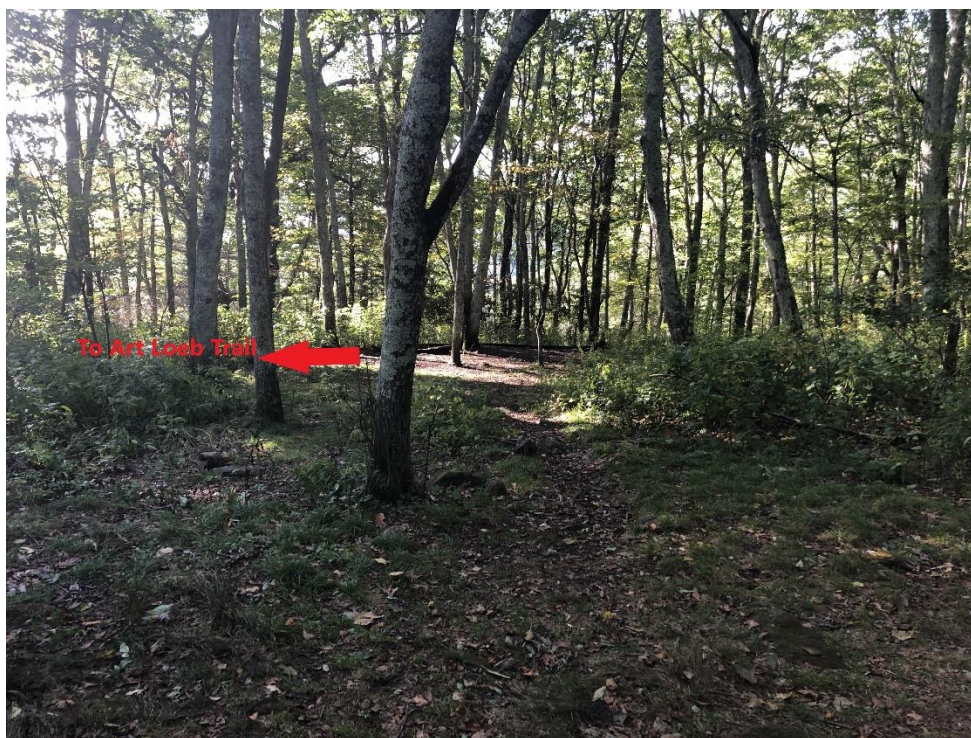
Figure 7: Deep Gap camp site