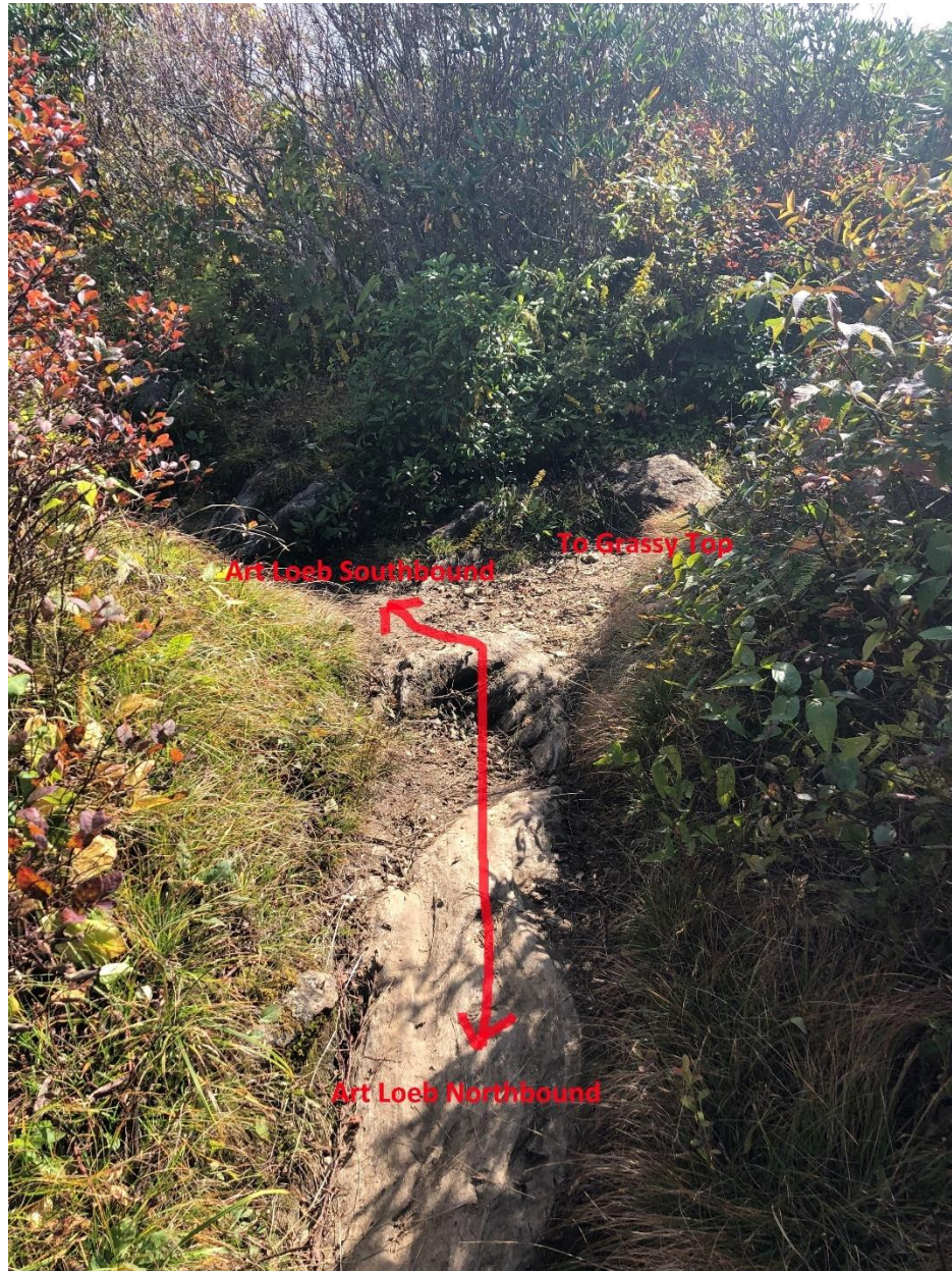
Figure 4: Art Loeb/Grassy Top intersection

Going northbound from Ivester Gap, hikers go around Grassy Cove Top and then down into Flower Gap. Once the trail goes around Grassy Cove Top, the trail intersects at a T junction. The Art Loeb trail turns to the right at the T and goes down into Flower Gap. See Figure 4: Art Loeb/Grassy Top intersection.