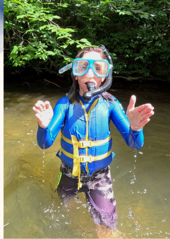
▲ LINCOLN SPOTS A BIG ONE