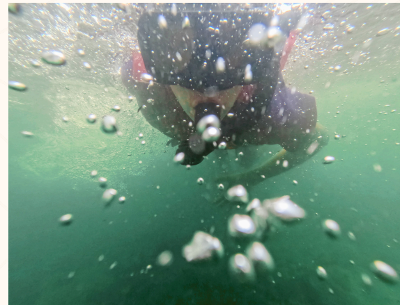
▲ KIRILL DEMONSTRATES PROPER DIVING TECHNIQUES