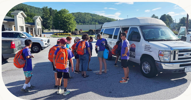
Explorers gear up for their first trip!

At every event, safety is something we plan for long before the day begins. Our staff are First Aid and CPR certified, and we bring multiple fully stocked first aid kits and sunblock to every outing. We check our gear, stay aware of weather conditions, and communicate clearly with all participants. These steps allow us to focus on what really matters: helping our Explorers try new things, stay engaged, and enjoy the outdoors with confidence. A safe day is a fun day, and that is always our goal.